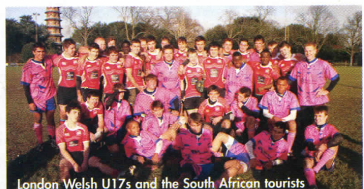
London Welsh U17s and the South African tourists

Door of opportunity. London Welsh RFC Under 17s have received a boost, courtesy of London Door Company. The South-West London firm, which makes high quality period and contemporary doors, sponsored the shirt for the recent U17s game against a visiting South African Barbarians school side. It is also raising money for this year's U17s tour.